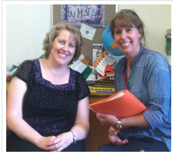
Personally recruit volunteers according to their talents and support them along the way