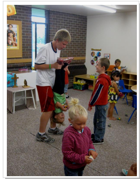
Youth make great helpers with preschoolers