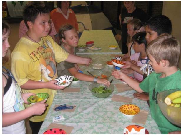
Offering a variety of fruits and/or vegetables will allow children to choose healthy snacks