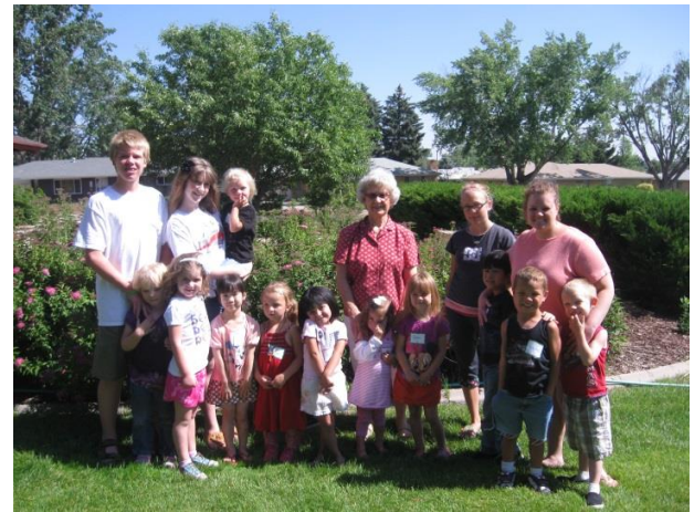
Preschool group includes ages 3-5 (must be toilet-trained)