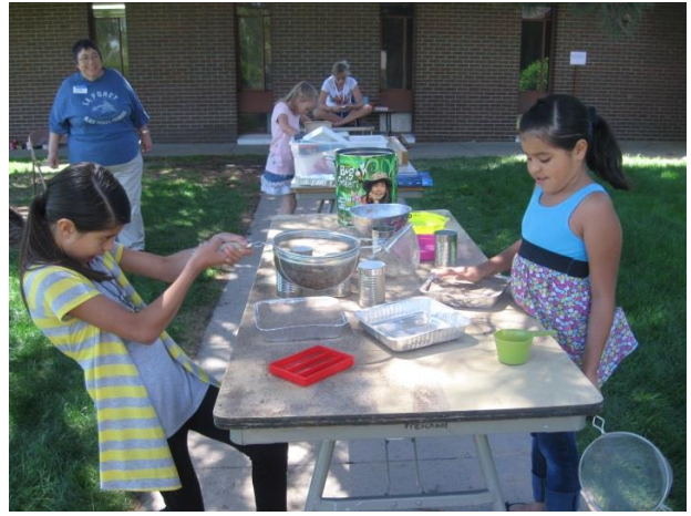
Sifting sand donated from a local farmer to make our own prayer gardens