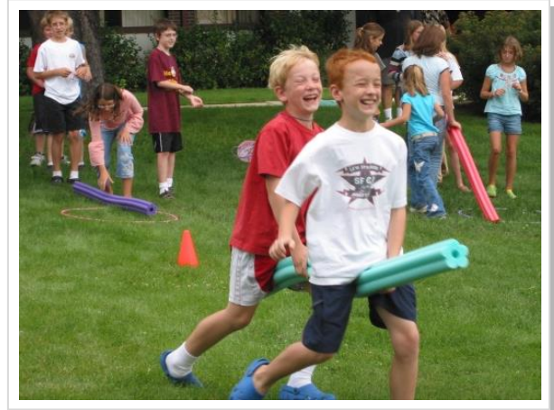
Use Pool Noodles for relays and other games