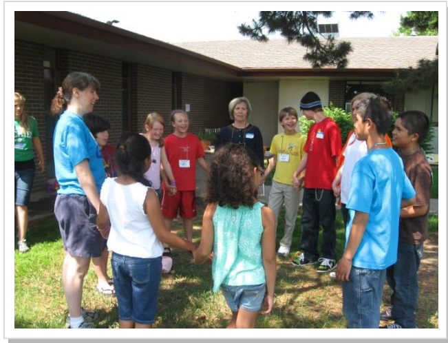
Praying together is important