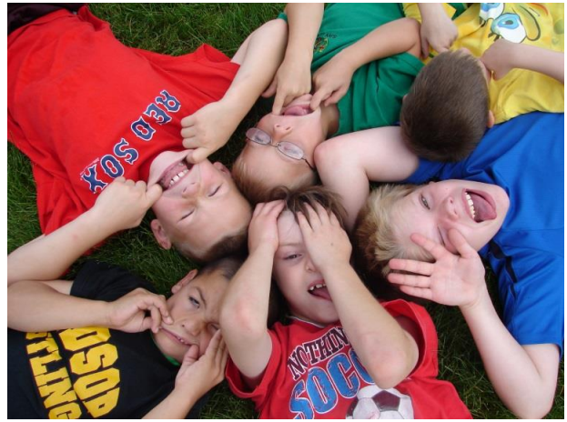
Meeting people and making new friends!