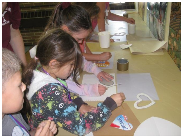
Using lemon juice to write invisible messages of God's love