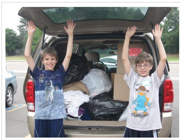
Youth can also collect clothing, food, toys, books, etc. to take to their Mission Crew site.