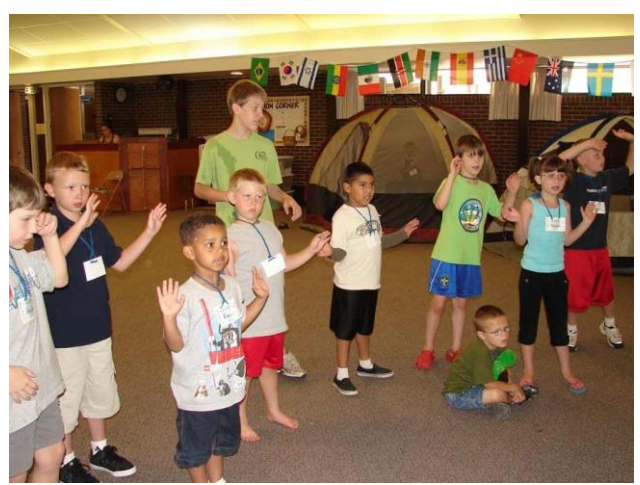
Encourage active participation, but don't force it