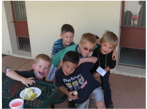
Eating outside makes clean up much easier