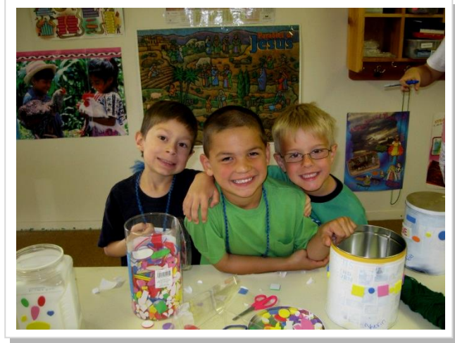
Making African drums