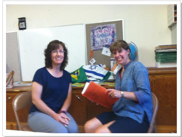
You may want to have co-directors