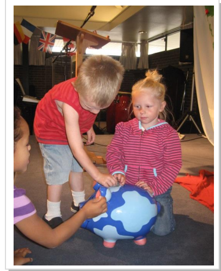
Collect offering early so it isn't a distraction and doesn't get lost