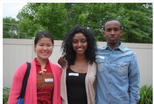
Finding guest speakers may be easier than you think!