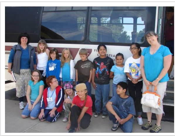
The older children love helping others in their community!

Information about Mission Crew should be included in the Letter to Parents or in a separate note to parents.