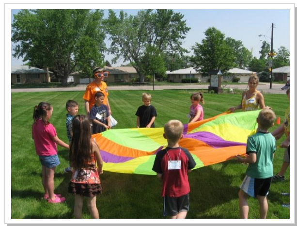
Everyone enjoys parachute games and looks forward to them each year