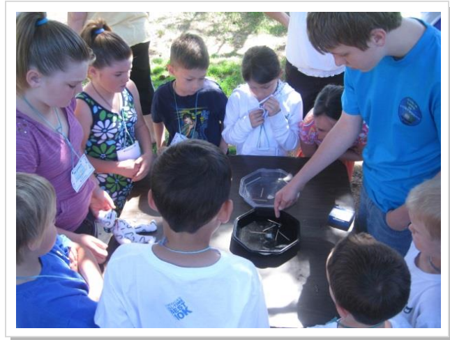
Science experiment led by a youth leader