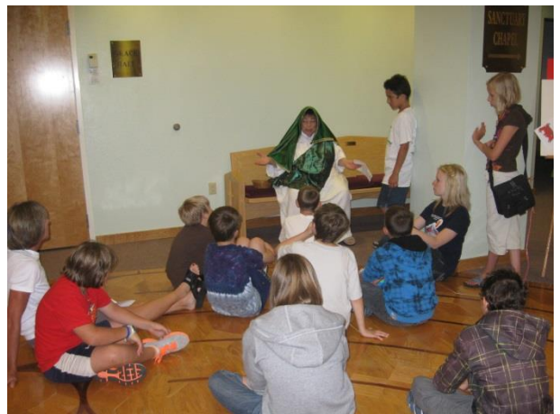
Dress up as a native of the country of the day