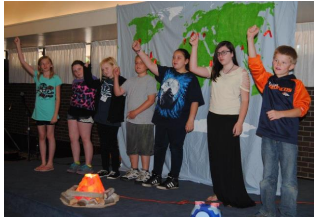
Campfire singers teach motions to a song