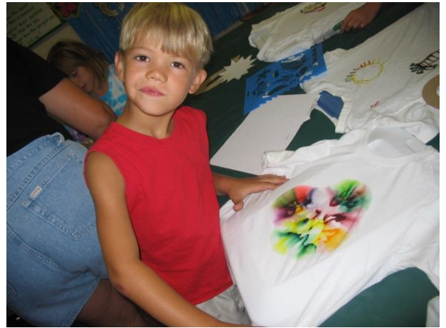
T-shirt design using permanent marker and rubbing alcohol; make sure you have good ventilation