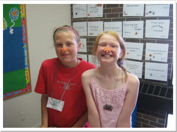
VBS is fun!