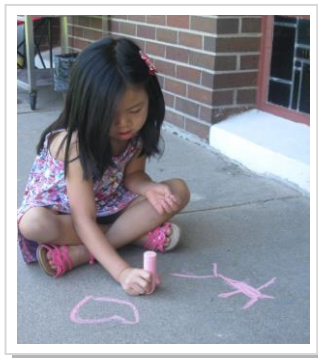
Sidewalk chalk is a VBS favorite