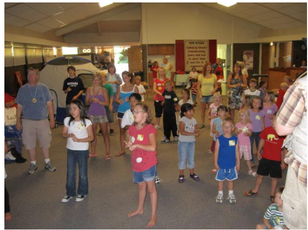
Singing together during Opening Assembly