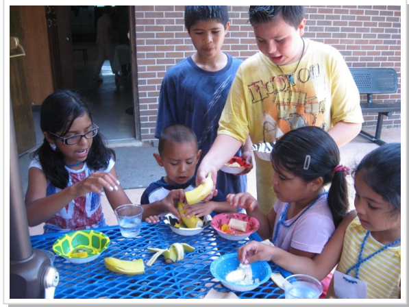
Teaching manners, including cleaning up afterward, is a great idea