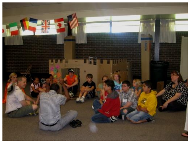
A family group listens to a guest speaker from our local Global refugee center – one of the best experiences of VBS!