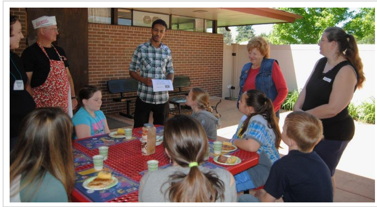
A guest speaker shares about his native country during snack time