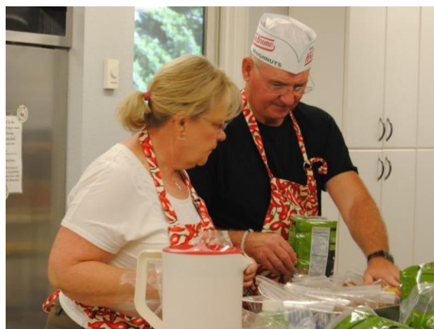
Many church members will enjoy being involved in VBS