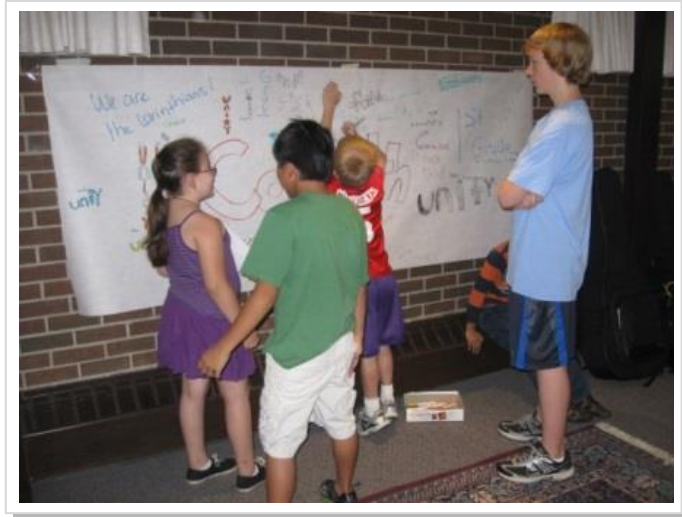
A youth helper as well as adult leader in each family group is helpful!