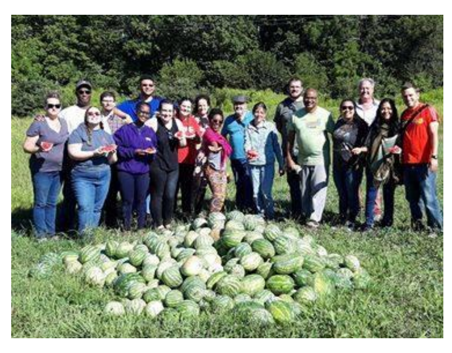
Some of our co-workers from Mission Conference in August 2019

1. Choose a mission co-worker. You can find more details about each coworker if you click on their name in the "People in Mission" section of globalministries.org Everyone is excited and ready to be connected.