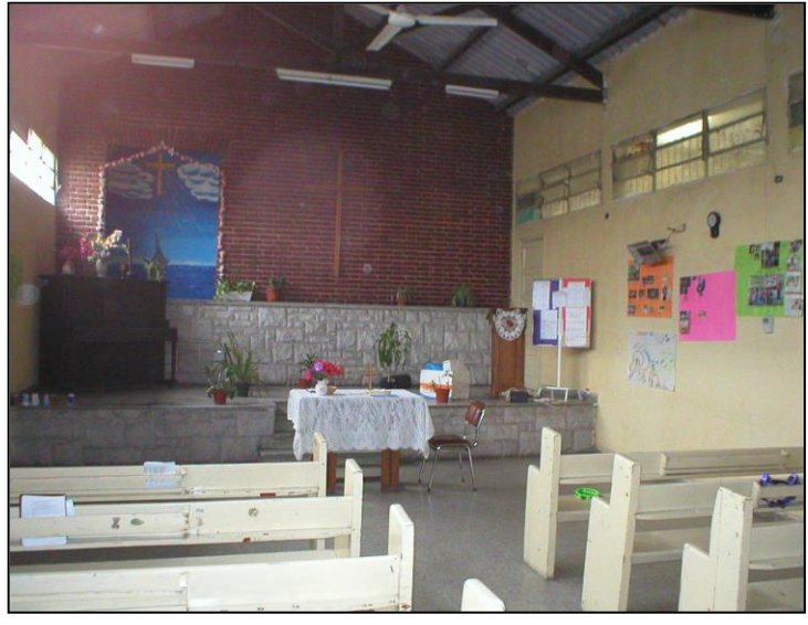
Does the Sanctuary in the Tablada church look like the sanctuary in your church?

Tablada is a town outside the big city of Buenos Aires. Did you know that Buenos Aires is the 8<sup>th</sup> largest city in the world? Tablada is an area where most of the families do not have jobs. The church here offers a place for the children to come before or after school. They get to eat lunch as well as breakfast or a snack. This will probably be the only food they have that day.