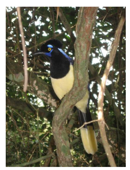
A Plush-crested Jay near Iguazu Falls

(Atlanta, Georgia) Being at the same latitude means these cities are the same distance from the equator. What do you think this means about weather and temperature of these areas? (They are similar depending on altitude, terrain, etc.) In this case, the climate in Atlanta is very similar to that of Buenos Aires. It gets cold in the winter (remember that is our summer!), but generally does not snow. Find your city and figure out its latitude. Which city in Argentina might be similar? Find out what that city is like. Notice how far east South America is compared to the United States? What time do you think it is in Buenos Aires? Why? (Longitude shows 2 hours ahead of Eastern Standard Time depending on daylight savings time.)