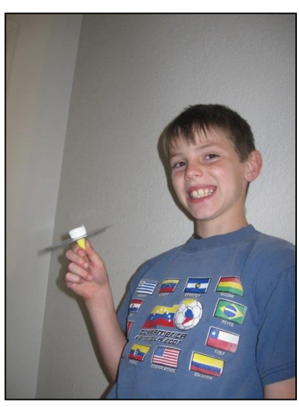
Look who has the winning top!

Spinning Tops - The children at Tablada Community Center made spinning tops from used liquid glue bottle tops and discarded CDs. Paint all the CDs white on one side ahead of time. The kids can then use permanent markers or paint to decorate them. Take apart the glue top and place the CD between the pieces and reattach. Next, wind a piece of string around the white part, place a pencil or similar shaped object into the hole at the top, and pull the string. A fun game played in Argentina is called, La Dura. It's simple: the person who gets their top to spin the longest wins! It is fun to practice, and this can also be used to determine who will go first at the next game.