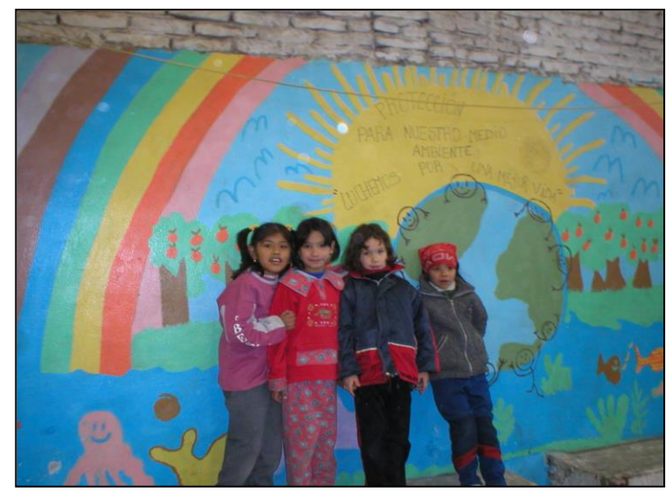
The mural at the Tablada Church and Community Center reads Protection for our environment, ''We are fighting for a better life.''

They also have an area to play their favorite sport of soccer as well as other games. They get help with their homework and a place to shower. One year we painted a mural with a beautiful rainbow. The children designed the mural and also painted it. What a great way to brighten the world!