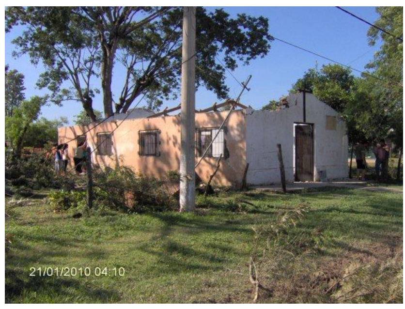
Vedia, Argentina; Feb. 5, 2010