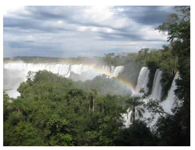
Iguazu Falls in Northern Argentina

Discover Latitude and Longitude - Take a look at a map or globe. Which country and/or city is located at the same latitude as Buenos Aires, Argentina?